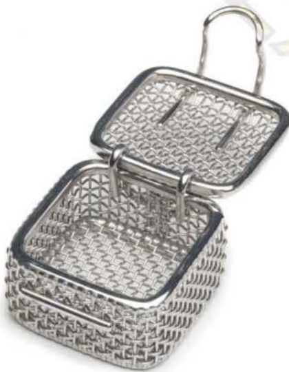
AV-018 Sterilization Mesh Cassette, 8 x 8 x 3.4 cm (3.1 x 3.1 x 1.4")