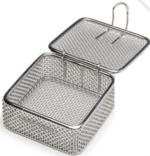
AV-017 Sterilization Mesh Cassette, 4 x 4 x 2 cm (1.5 x 1.5 x .75")