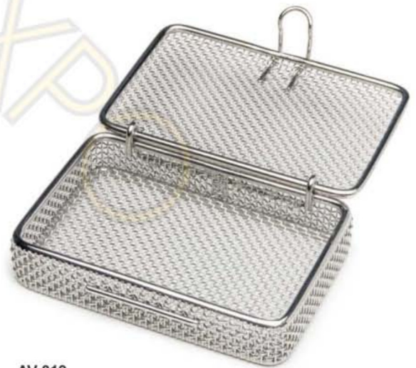
AV-019 Sterilization Mesh Cassette, 10.5 x 7 x 2.5 cm (4.1 x 2.75 x 1")