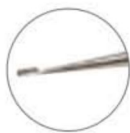
Winged Elevator 1mm

The stubby handle elevators available as a 6 pc. set. See page 16